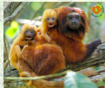
A mother with her two infants

Mating takes place between June and July , the dry and cool season for the Southern Hemisphere. Infants, usually twins, are born after a gestation period of about 130 days . Most births take place between September and November, at the beginning of the rainy season when fruits are most abundant.