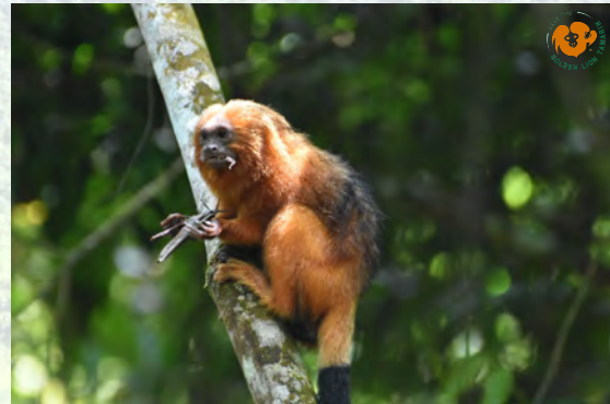
A GLT snacks on a cricket

These primates are omnivores , feeding on a variety of food items including fruits, nectar, insects, and small vertebrates. Fruits and insects make up the bulk of their diet.