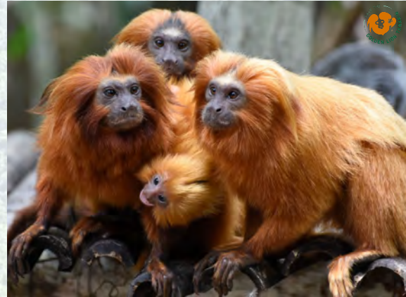
One of many GLT Families

GLTs are social animals, living in family groups that consist of two to ten individuals, but average about five to six to a group. A family group typically contains a breeding pair (mom and dad) and their offspring (usually twins) from one or two litters. The group may also include an aunt or uncle.